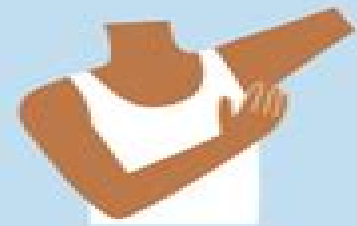
Loss of armpit and pubic hair