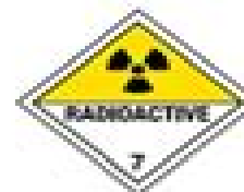
Class 7 Radioactive