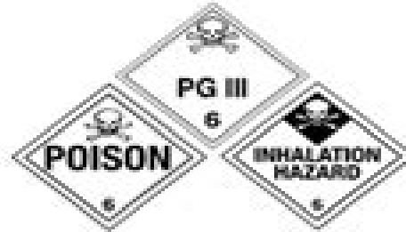
Class 6 Poison (Toxic) Poison Inhalation Hazard