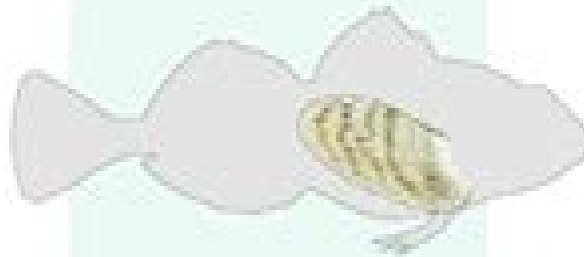
fish (sculpin) fin