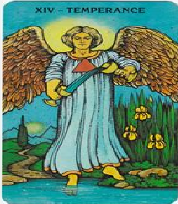
XIV - TEMPERANCE