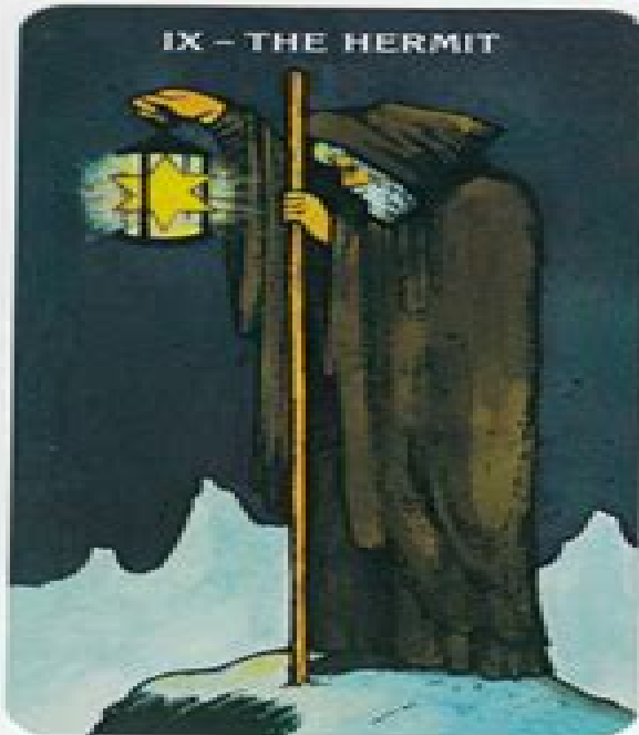
IX - THE HERMIT