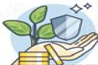
ECONOMIC AND SOCIAL SAFETY