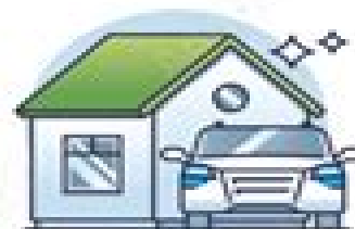
MATERIAL LIVING CONDITIONS