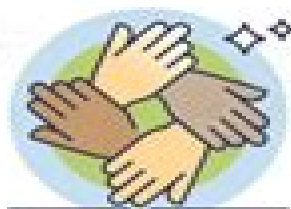
SOCIAL RELATIONS AND LEISURE