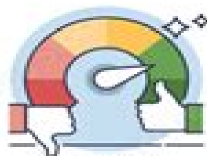
OVERALL EXPERIENCE OF LIFE