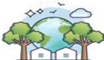
NATURAL LIVING ENVIRONMENT