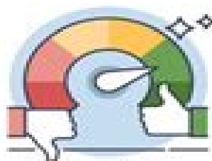
OVERALL EXPERIENCE OF LIFE