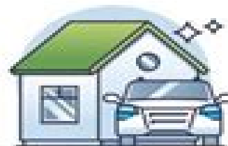
MATERIAL LIVING CONDITIONS