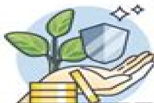
ECONOMIC AND SOCIAL SAFETY