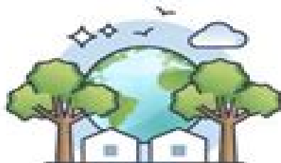
NATURAL LIVING ENVIRONMENT