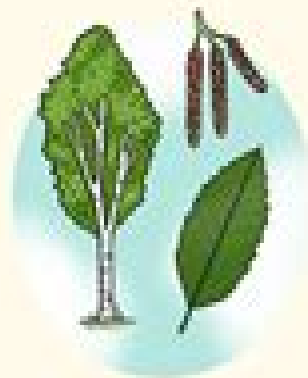
Red alder ( Alnus rubra )