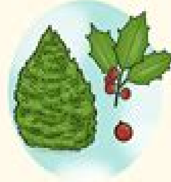
American holly ( Quercus rubra )