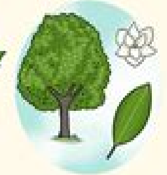
Southern magnolia ( Magnolia grandiflora )