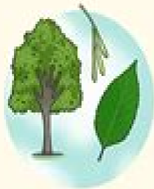
Green ash ( Fraxinus pennsylvanica )