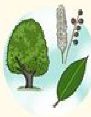
Black cherry ( Prunus serotina )