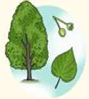
American basswood ( Tilia americana )