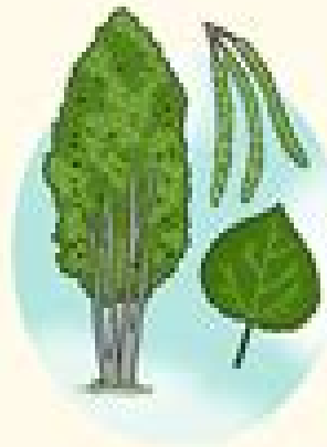
Quaking aspen ( Populus tremuloides )