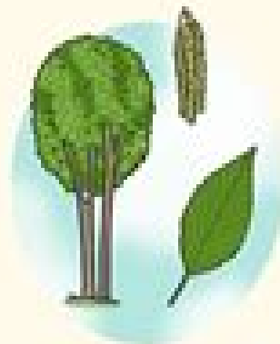
Yellow birch ( Betula alleghaniensis )