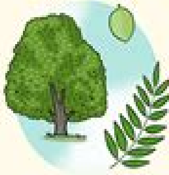
Butternut ( Juglans cinerea )