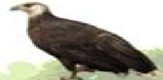
Madagascar Fish Eagle