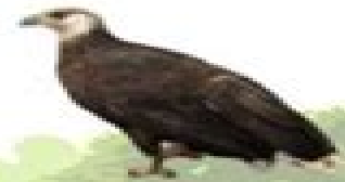
Madagascar Fish Eagle