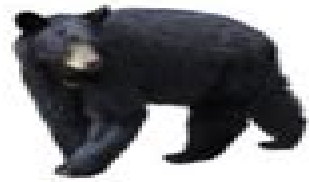
American Black Bear