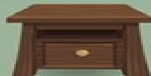
mesita de noche