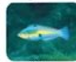
Clown Wrasse Halichoeres maculipinna