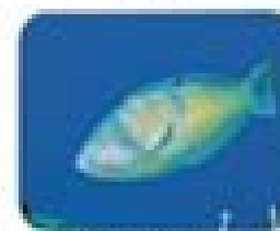
Puddingwife Halichoeres radiatus