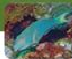
Yellowtail Parrotfish Sparisoma rubripinne