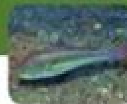
Emerald Parrotfish Nicholsina uza