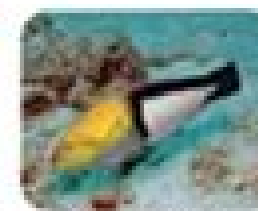
Yellowhead Wrasse Halichoeres garnoti