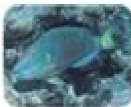
Stoplight Parrotfish Sparisoma viride