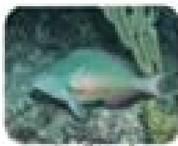
Redband Parrotfish Sparisoma aurofrenatum