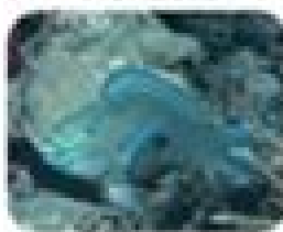
Queen Parrotfish Scaevola vetula