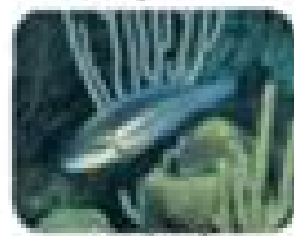
Striped Parrotfish Scaevola iseri