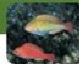
Greenblotch Parrotfish Sparisoma globarium