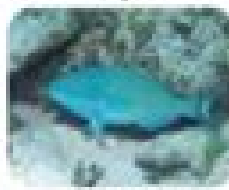
Redtail Parrotfish Sparisoma chrysopterum