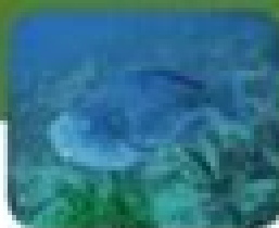
Blue Parrotfish Scaevola caeruleus