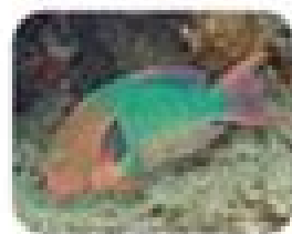
Rainbow Parrotfish Scaevola guacamaia