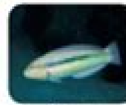
Slippery Dick Halichoeres bivittatus