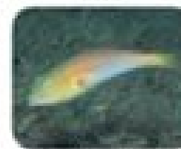
Bluelip Parrotfish Cryptotomus roseus