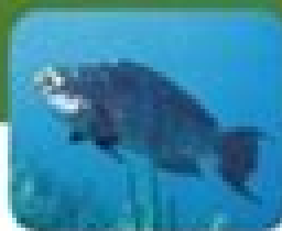
Midnight Parrotfish Scaevola coelestinus