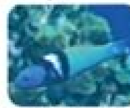
Bluehead Thalassoma bifasciatum