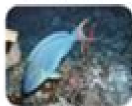
Reef Parrotfish Sparisoma amplum