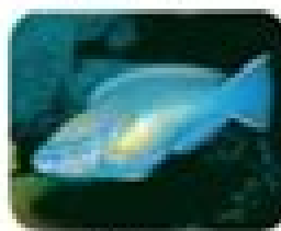
Princess Parrotfish Scaevola taeniopterus