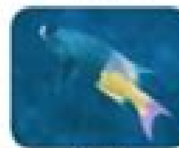
Creole Wrasse Clepticus parrae