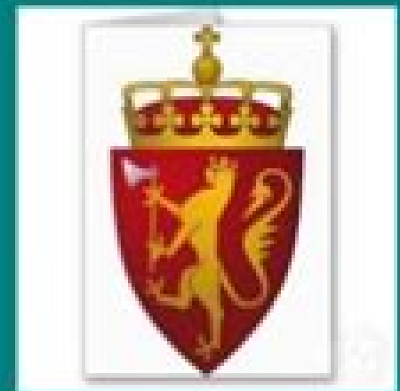
Coat of Norway