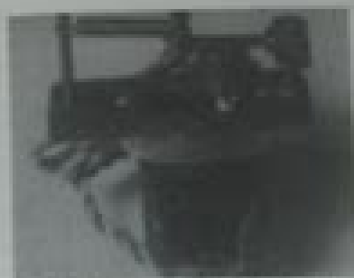
Fig. 6.6. Servo developed for the Simpson I.

In Chapter 4 we described the very simple Simpson control system for pulse rate and length. The servo designed by Dave Hubelin for this system is shown in Fig. 6.7 and 6.8 based upon the tiny Micro-Mite TG-4 motor which comes with built-in gearing of about 40:1. Since it is of 1/2 inch plywood and it is necessary to make a tight hole for the motor, which is held in with epoxy. The motor shaft gear is fastened from a metal plate wheel collar with a one sixteenth inch outer rim. On the end of the two selector holes, insert a short piece of hose tubing to partially fill the hole, then bend the cord from one sixteenth inch outer rim. Solder these parts together and