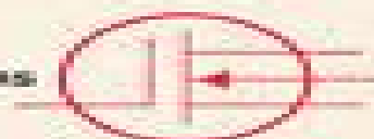
MOS FIELD-EFFECT TRANSISTORS