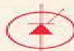
THYRISTORS < SCR'S TRACS