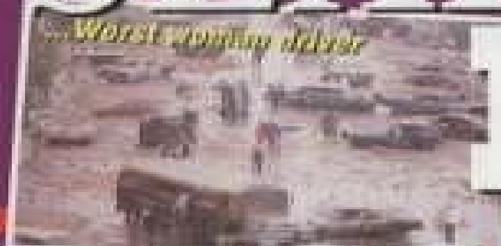
...Worst working dinner