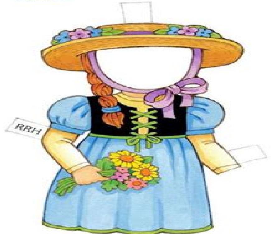
Little Red Riding Hood