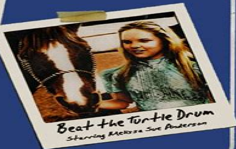
Beat the Turtle Drum Starring Melissa Sue Anderson