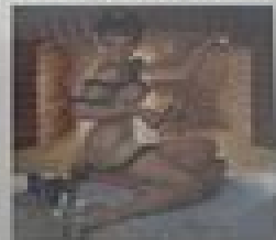
Red Dress 1950, Gil Elvgren, Pin-up Art

November | November | Novembre | Novembar | 11/11