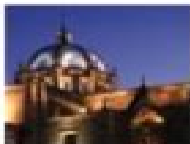
Basílica de San Marcos, México The Basilica of San Marcos in Mexico