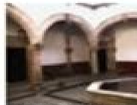
Basílica de San Marcos, México The Basilica of San Marcos in Mexico