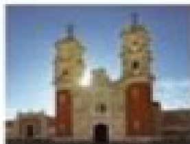
Basílica de San Marcos, México The Basilica of San Marcos in Mexico