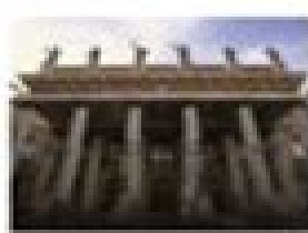
Basílica de San Marcos, México The Basilica of San Marcos in Mexico