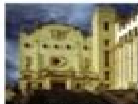
Basílica de San Marcos, México The Basilica of San Marcos in Mexico