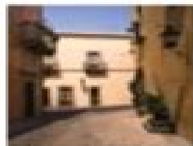
Basílica de San Marcos, México The Basilica of San Marcos in Mexico