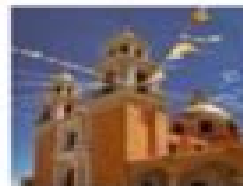
Basílica de San Marcos, México The Basilica of San Marcos in Mexico