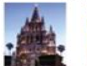
Basílica de San Marcos, México The Basilica of San Marcos in Mexico