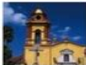
Basílica de San Marcos, México The Basilica of San Marcos in Mexico