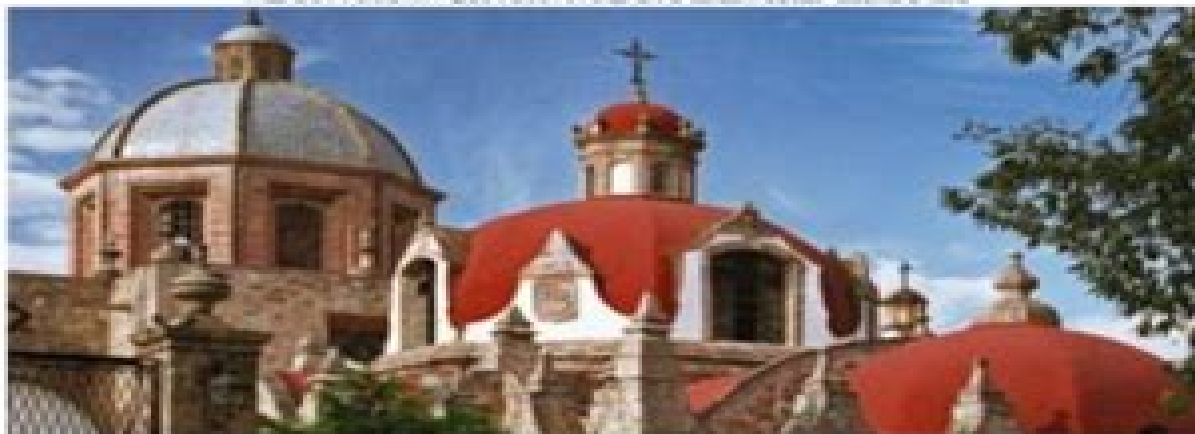
Basílica de San Marcos, México The Basilica of San Marcos in Mexico