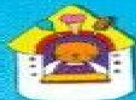
le stand de friandises