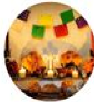
DIA DE LOS MUERTOS