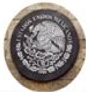
MEXICAN COAT OF ARMS