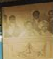
FRANCIS OGBURN AND SON