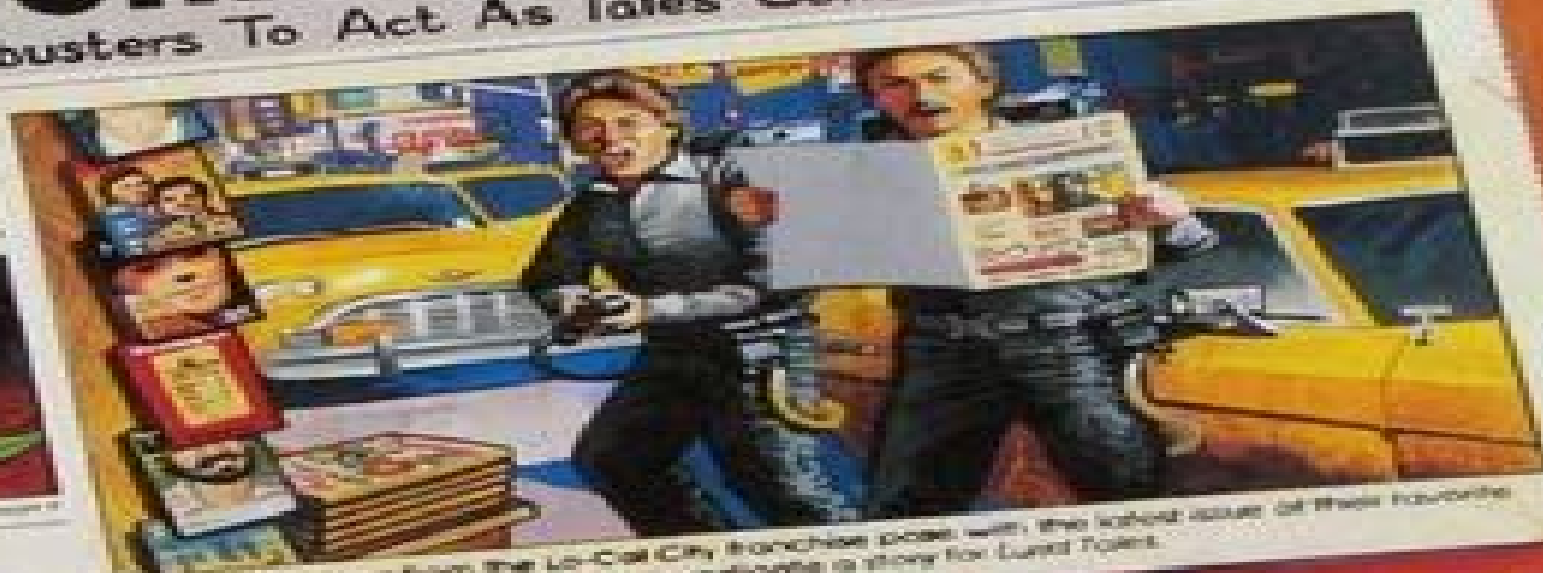
Two Ghostbusters from the Lo-Cal City Franchise pose with the latest issue of their favorite magazine before heading out to investigate a store for Lurid Tales.

CRAZY YETI ICE MONSTER SEEN AT STUDIO 23