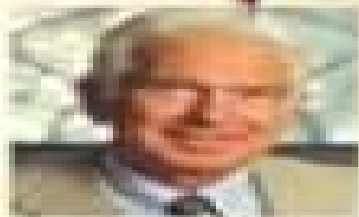
Dr. Warren Bennis Leadership Expert, Author of Ones to Watch