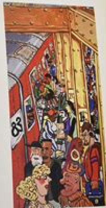
80 Study for Museum Piece, 2009 enamel on paper, 18 x 10 in., 1973 & 2010