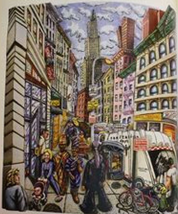
78 Looking Down Broadway Towards the Museum of Modern Art enamel on paper, 18 x 10 1/2 x 14 in., 2007 & 2009 & 2010