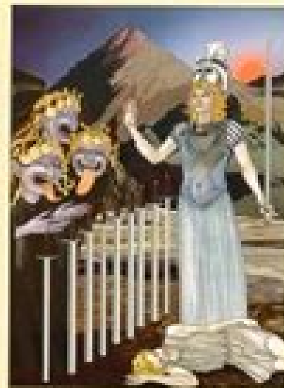
TEN OF SWORDS