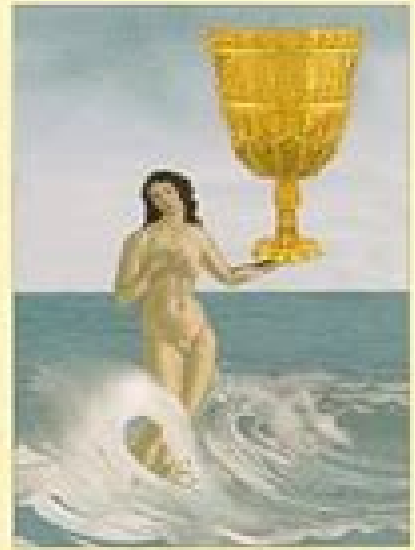
ACE OF CUPS