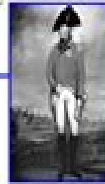
Portrait of the Hanoverian George III, by Sir Allan Ramsay

king of Great Britain and Ireland reigned 1760–1820