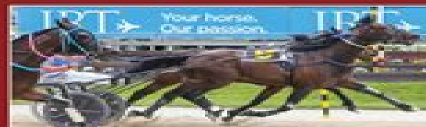
Royal Pride winning over 3200m Cup Day 2022 6 wins | $76,689 to date