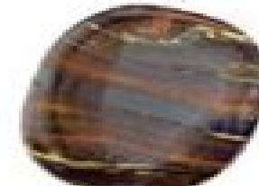
Tiger Iron ESTR