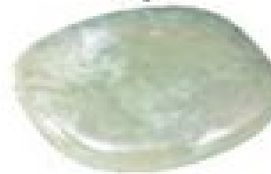
New Jade ESjA