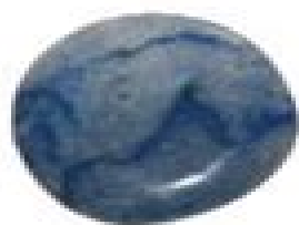
Blue Quartz ESBQ