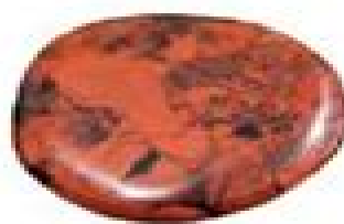
Brecciated Jasper ESBj