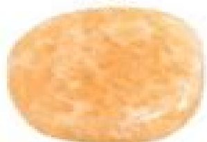
Orange Calcite ESOC