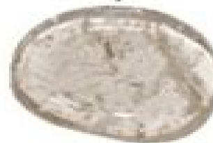
Smokey Quartz ESSQ