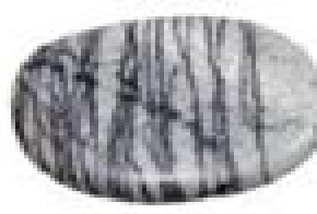
Net Jasper ESNj