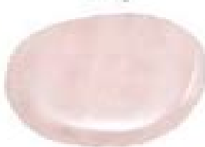
Rose Quartz ESRQ