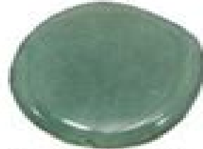
Green Aventurine ESGA