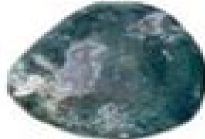
Moss Agate ESMA