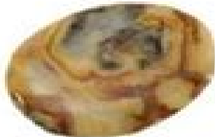
Lace Agate ESLA