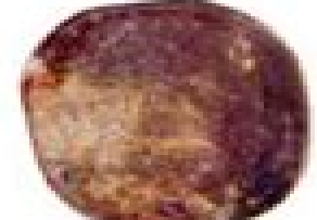
Fancy Jasper ESFj