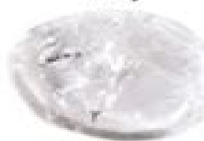
Clear Quartz ESCQ