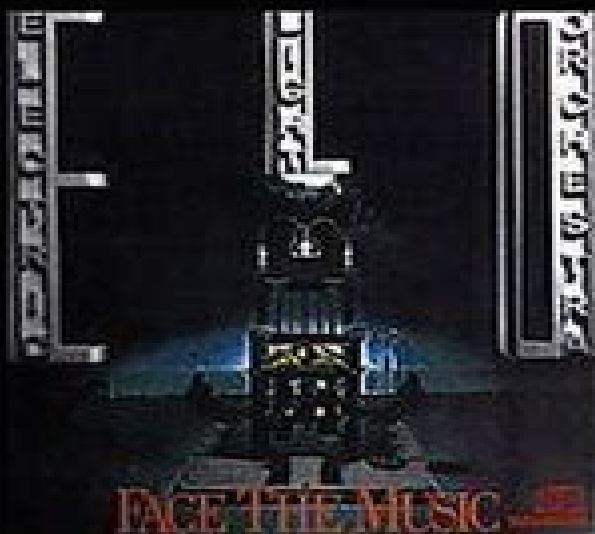
FACE THE MUSIC