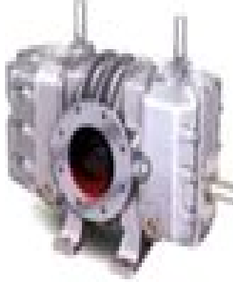
Root Type Pump