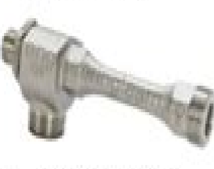
Eductor Jet Pump