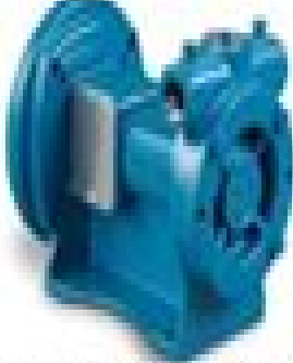
Regenerative Turbine Pump