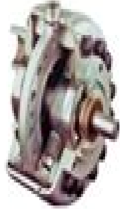
Radial Piston Pump