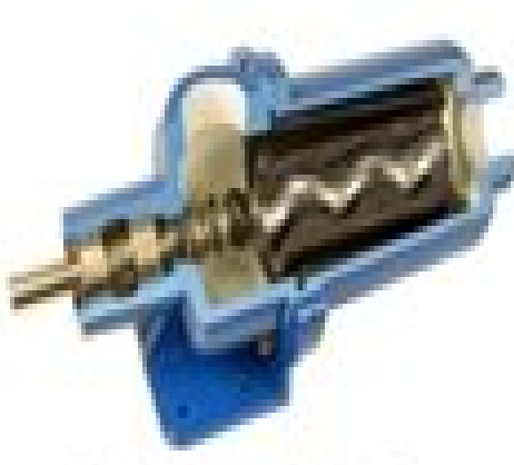
Progressing Cavity Pump