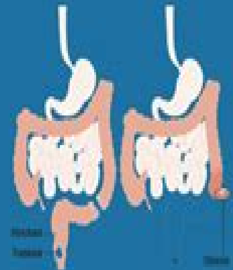
ABDOMINO PERINEAL RESECTION