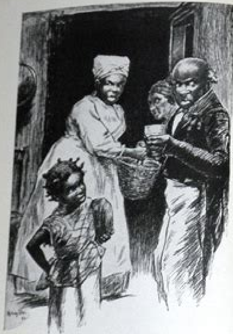
BOXY HARVESTING AMONG THE KITCHENS