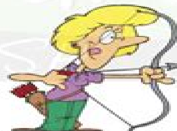
TIRO CON ARCO