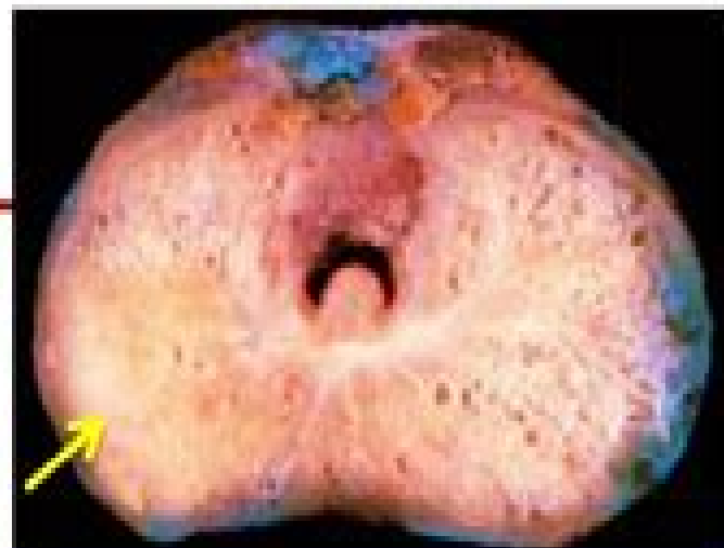
Gross: Hard, gritty / stoney