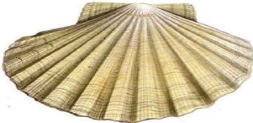
5. Great scallop Pecten maximus