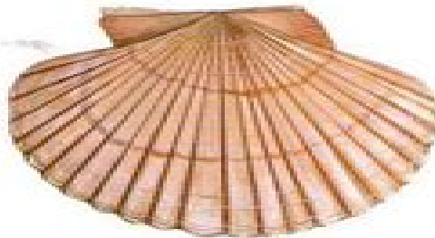
6. Queen scallop Aequipecten opercularis