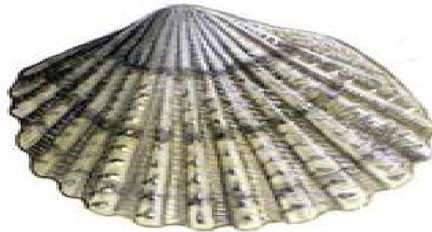
4. Prickly cockle Acanthocardia echinata