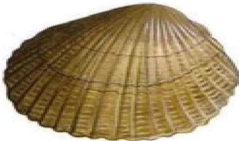
3. Common cockle Cerastoderma edule