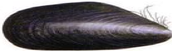
1. Common mussel Mytilus edulis