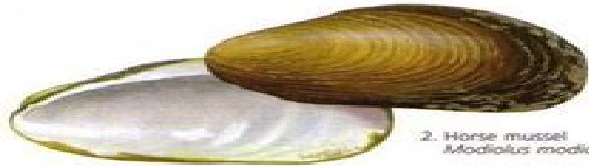
2. Horse mussel Modiolus modiolus