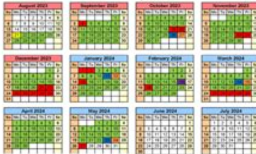
2023/24 School Calendar Option 1