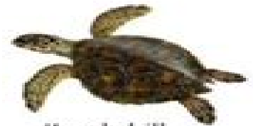
Hawksbill Sea Turtle