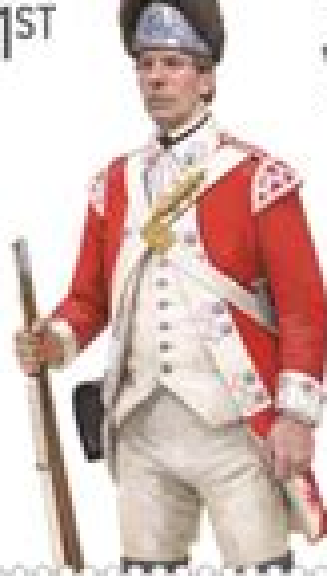
Grenadier, Chatham Division, His Majesty's Marine Forces, 1775