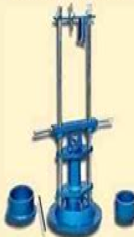
Impact Value Test