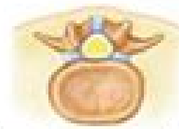
Normal newborn vertebra