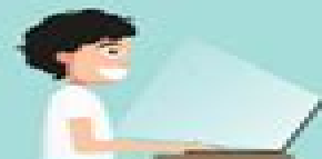
90.99% Computer Vision