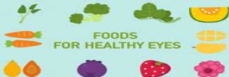
FOODS FOR HEALTHY EYES