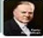
HERBERT HOOVER 1933-1937