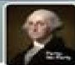
GEORGE WASHINGTON 1789-1797