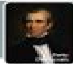
JAMES K. POLK 1845-1849