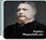
CHESTER ARTHUR 1881-1885