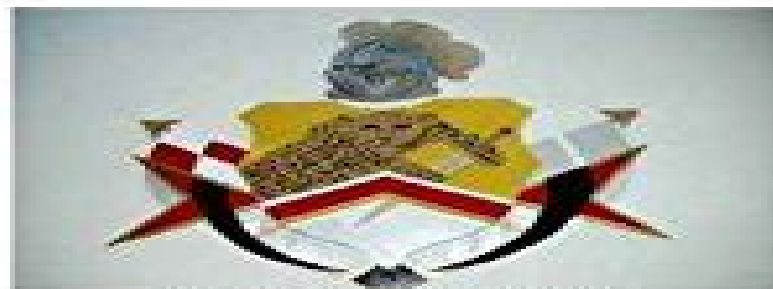
Marciana Marcina Livorno 7 Novembre 1823 Isola di Elba, Italia