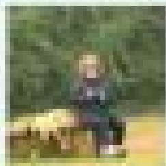
Life-Transforming Disability Inclusion