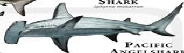
GREAT HAMMERHEAD SHARK Sphyrna maximus