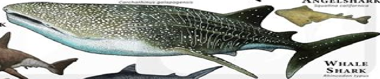
WHALE SHARK Rhincodon typus