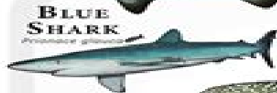
BLUE SHARK Prionace glauca