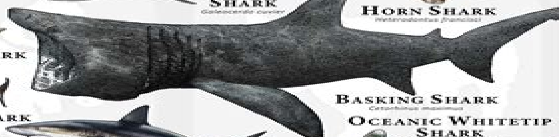
BASKING SHARK Cetorhinus maximus