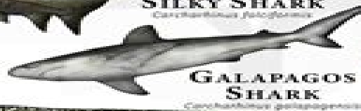
GALAPAGOS SHARK Carcharias galapagensis