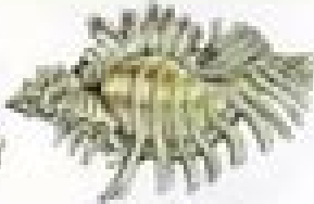
Lace Murex (CB)

Cerithium foliatum To 1.5 in. (4 cm) high Shell has three large, leaf-like flanges. Color varies from white to dark brown depending on location.