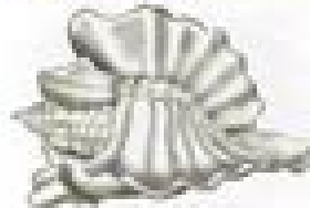
Foliate Thornmouth (W)

Cerithium foliatum To 1.5 in. (4 cm) high Shell has three large, leaf-like flanges. Color varies from white to dark brown depending on location.