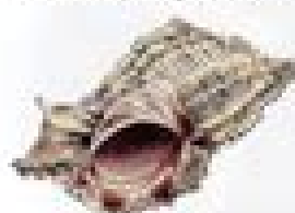
Apple Murex (CB)

Chamaelea lamarckii To 2 in. (5 cm) Elaborate pinkish-white to brownish shell with long teeth.