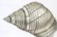
Marsh Periwinkle (CB,V)

Euryspira caudata To 1.5 in. (4 cm) high Small shell has a pointed apex and spiral ridges. Feeds primarily on oysters.