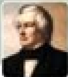
MILLARD FILLMORE 1850-1853