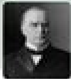
THEODORE ROOSEVELT 1901-1909