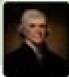
THOMAS JEFFERSON 1801-1809