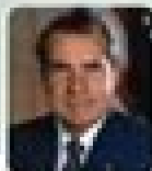
GERALD R. FORD 1974-1977