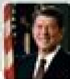
GEORGE H. W. BUSH 1989-1993