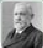
BENJAMIN HARRISON 1889-1893