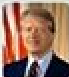
RONALD REAGAN 1981-1989