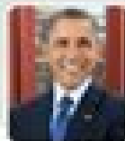
DONALD TRUMP 2017-2021