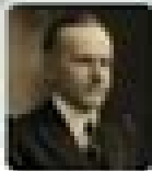
HERBERT HOOVER 1929-1933