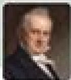
JAMES BUCHANAN 1857-1861