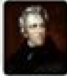
ANDREW JACKSON 1829-1837