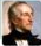
JOHN TYLER 1841-1845