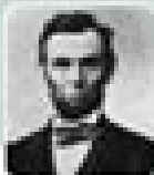
ABRAHAM LINCOLN 1861-1865