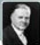
FRANKLIN D. ROOSEVELT 1933-1945