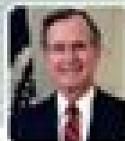
BILL CLINTON 1993-2001