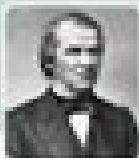
ANDREW JOHNSON 1865-1869