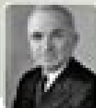
DWIGHT D. EISENHOWER 1953-1961