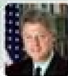
GEORGE W. BUSH 2001-2009