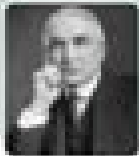
CALVIN COOLIDGE 1923-1929