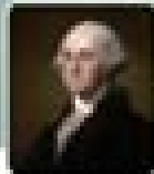
GEORGE WASHINGTON 1789-1797