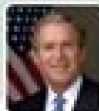
BARACK OBAMA 2009-2017