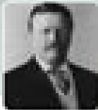
WILLIAM HOWARD TAFT 1909-1913