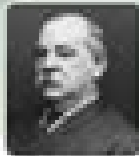
WILLIAM MCKINLEY 1897-1901