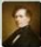
FRANKLIN PIERCE 1853-1857