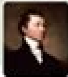
JAMES MONROE 1817-1825