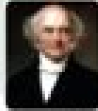
MARTIN VAN BUREN 1837-1841