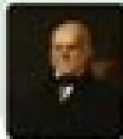
JOHN QUINCY ADAMS 1825-1829