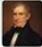
WILLIAM HENRY HARRISON 1841