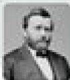
ULYSSES S. GRANT 1869-1877