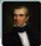
JAMES K. POLK 1845-1849