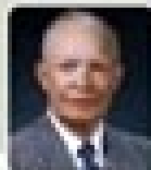
JOHN F. KENNEDY 1961-1963