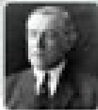
WARREN G. HARDING 1921-1923