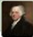
JOHN ADAMS 1797-1801