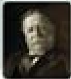
WOODROW WILSON 1913-1921