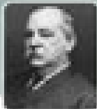
GROVER CLEVELAND 1885-1889