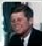
LYNDON B. JOHNSON 1963-1969