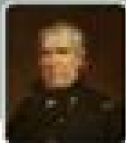
ZACHARY TAYLOR 1849-1850