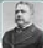
CHESTER A. ARTHUR 1881-1885