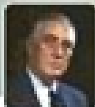
HARRY S. TRUMAN 1945-1953