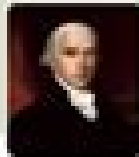
JAMES MADISON 1809-1817