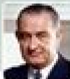
RICHARD NIXON 1969-1974