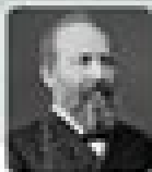
JAMES A. GARFIELD 1881