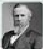
RUTHERFORD B. HAYES 1877-1881