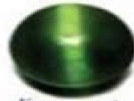
Kornerupine cats eye