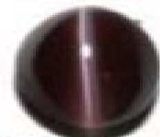
Sillimanite cats eye