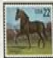
Morgan — A1539