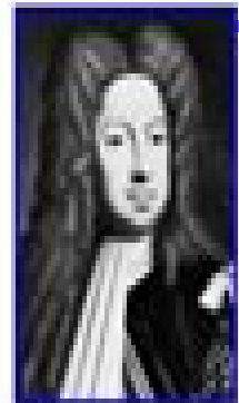
Portrait of the Hanoverian George I, by Sir Godfrey Kneller

In 1801, during the reign of King George III, the Act of Union formally united Great Britain and Ireland under the name of the United Kingdom of Great Britain and Ireland.