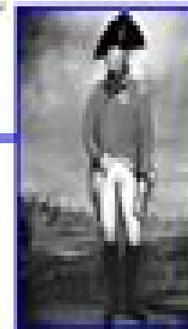
Portrait of the Hanoverian George III, by Sir Allan Ramsay

king of Great Britain and Ireland reigned 1760–1820