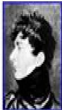
Portrait of the Hanoverian George IV, by Sir Allan Ramsay