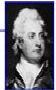
Portrait of the Hanoverian William IV, by Sir Allan Ramsay

king of United Kingdom reigned 1830–1837