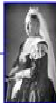
Portrait of the Hanoverian Victoria, by Sir Allan Ramsay

queen of United Kingdom reigned 1837–1901 [See House of Windsor]